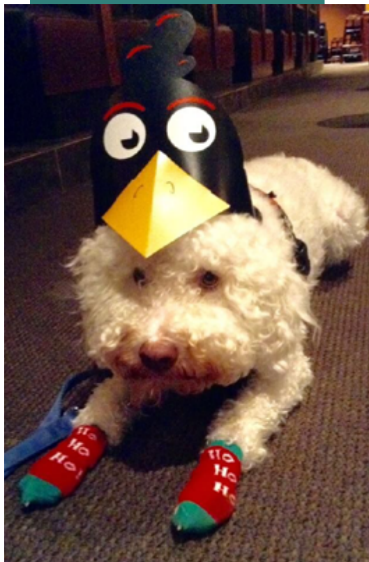
Cupido's Christmas socks

The Nose Knows. With more than 220 million olfactory receptors in its nose, a dog has an impeccable sense of smell. Humans have only a tiny five million. This makes canines perfect service animals for individuals with food allergies or intolerances.