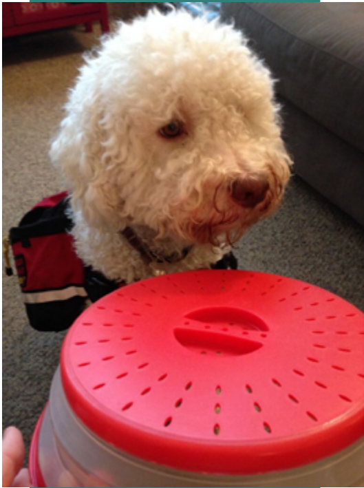
This is how Cupido detects gluten in food